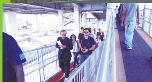
◀ Evacuation tower being inspected by JICA trainees

Based on the lessons learned from the Great East Japan Earthquake, Sendai city is building 13 tsunami evacuation facilities (towers, buildings, etc.) in the eastern areas, which are susceptible to tsunami floods.