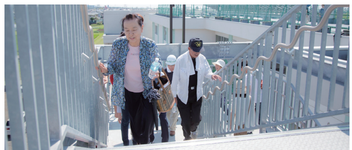
▲ Evacuation stairs at Okada Elementary School

November 5 is World Tsunami Awareness Day designated by the UN General Assembly in 2015. Many different disasters occur frequently all over the world, and we hope that we will be able to help prepare for these disasters and reduce their impact by sharing our experiences of the Great East Japan Earthquake, the lessons we have learned, and our disaster prevention efforts with the world.